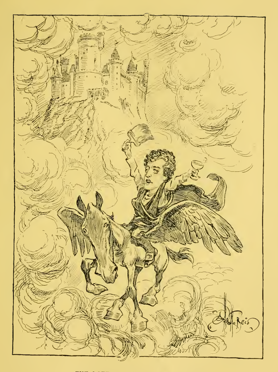
THE POET BYRON BUILDING CASTLES